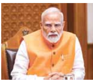
Prime Minister Narendra Modi chairs a meeting with Defence Minister Rajnath Singh, NSA Ajit Doval and armed forces chiefs in New Delhi

Chief of Defence Staff General Anil Chauhan was also part of the meeting, which was held amid India weighing its options for countermeasures following the Pahalgam terror attack which left at least