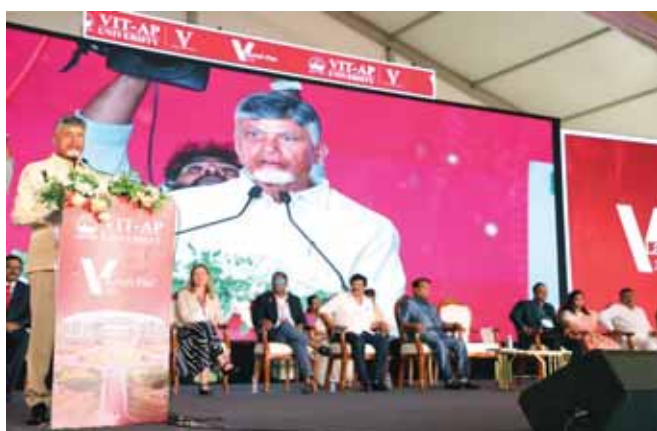
Chandrababu Naidu giving speech at inauguration ceremony

The Chief Minister, who had laid the foundation stone for the Central Block of VIT-AP in 2016, has graced the occasion as chief guest today and inaugurated the Mahatma Gandhi Academic Block — India's largest single academic block. Standing tall at 45 metres and spanning 7.68 lakh square feet, the block houses cutting-edge classrooms, lecture halls, collab-