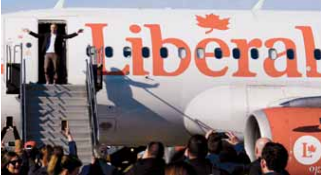
Liberal Leader Mark Carney arrives in Ottawa in Canada

The Liberals were leading or elected in 168 seats when the counting was paused, four short of a majority. Elections Canada estimated that the uncounted votes could affect the result in about a dozen districts.