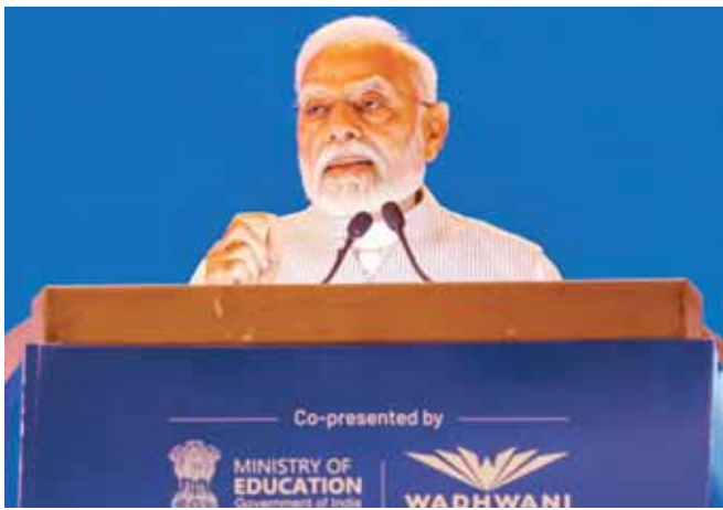
Prime Minister Narendra Modi

He stressed that reducing the distance from lab to market ensures faster delivery of research outcomes to the people, moti-