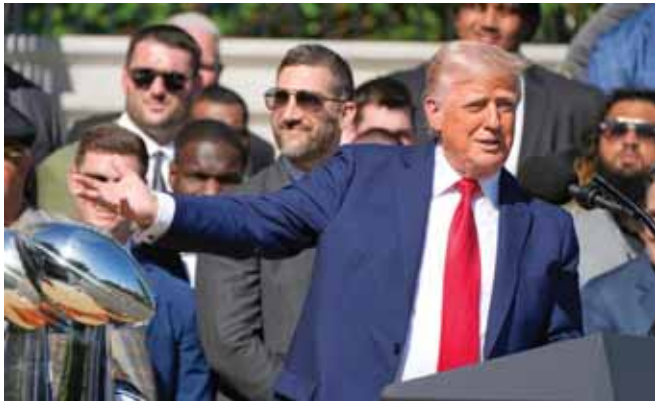
President Donald Trump speaks as he welcomes the Super Bowl champion Philadelphia Eagles