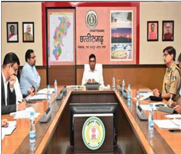
intendents of police to compulsorily hold periodic meetings of the District Coordination Committee to review the progress of implementation.