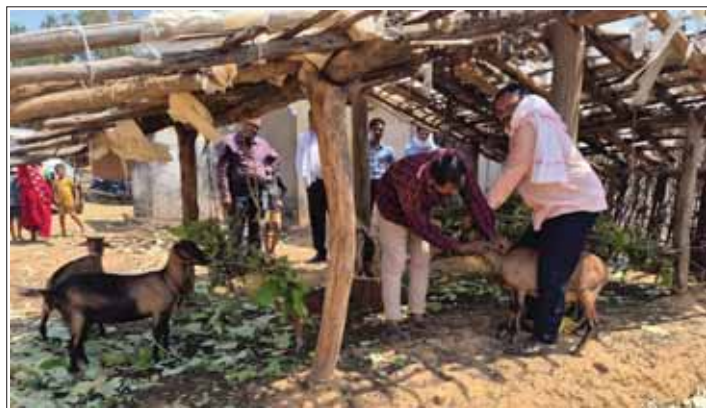
At the demand of the locals, a veterinary camp to vaccinate livestock was held for the first time in the remote Ghaton village in Chhattisgarh's Surguja district on Tuesday.

New standards are being set by Chhattisgarh in the field of health service delivery, he said. Health Minister Shyam Bihari Jaiswal said that the evaluation of 644 other institutions was in process.