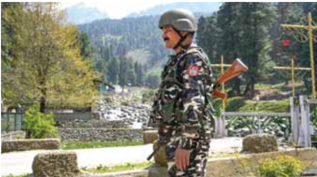
A security personnel stands guard a day after a terrorist attack in Pahalgam

Global leaders, including US President Donald Trump, US Vice President J D Vance, Russian President Vladimir Putin, UK Prime Minister Keir Starmer, Italian Prime Minister Giorgia Meloni, French President Emmanuel Macron, Israeli Prime Minister Benjamin Netanyahu and UN Secretary General Antonio Guterres condemned the Pahalgam terror attack and expressed their condolences and solidarity with India. Last week, the 15-nation UN Security Council issued a Press Statement condemning “in the strongest terms” the terrorist attack in Jammu and Kashmir,