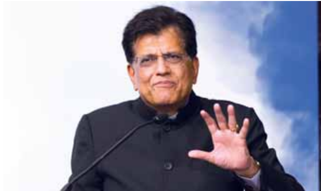
Union Minister Piyush Goyal speaks during the India-UK Business Roundtable

On Tuesday, the minister will meet UK Chancellor Rachel Reeves, among other senior officials. All eyes are on the FTA negotiations, which were re-launched in February following a pause for general elections last year. They are aimed at clinching a deal that is expected to significantly enhance the estimated GBP 41 billion a year India-UK trade partnership.