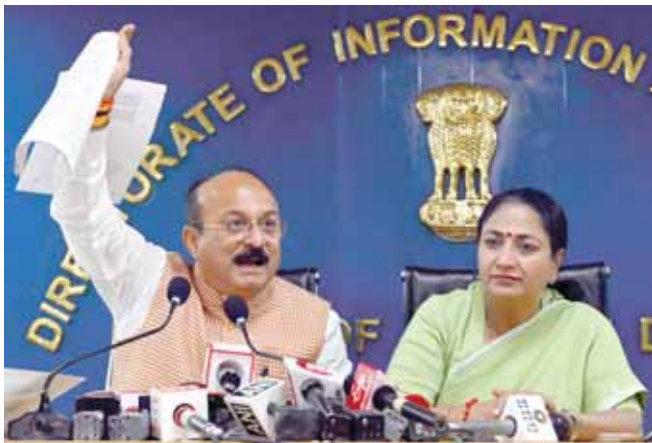
Delhi Chief Minister Rekha Gupta with Delhi Education Minister Ashish Sood addresses a press conference in New Delhi on Tuesday

Terming it a bold and holistic step by approving the draft of the Delhi School Education Transparency in Fixation and Regulation of Fees Bill, 2025 at the Cabinet meeting, Chief Minister Rekha Gupta said that schools will face strict