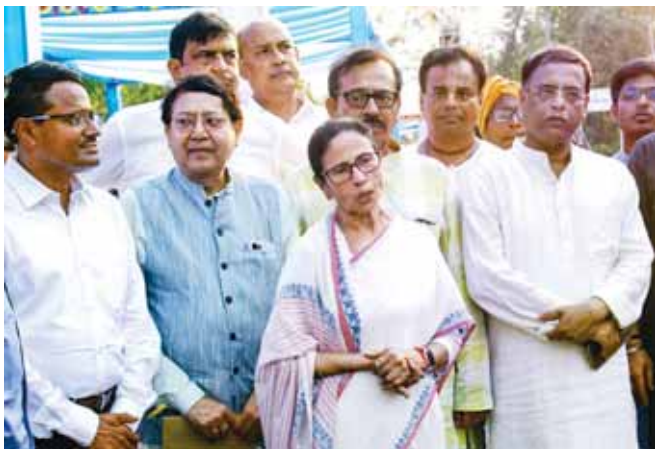
Chief Minister Mamata Banerjee speaks with the media on the eve of the inauguration of the Lord Jagannath temple at Digha in Purba Medinipur district in West Bengal on Tuesday

The Digha temple, almost equal in height too stands barely a few hundreds metre from the same sea and is expected to draw large number of tourists from