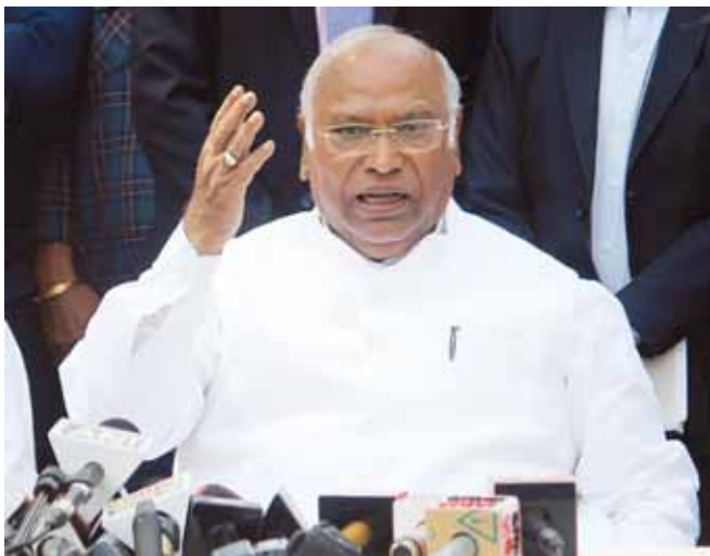
Congress chief Mallikarjun Kharge

"This is not an occasion for political debate, confrontations, people are worried, anguished, this is a traumatic event that took place in Pahalagam, it affected the entire country... An all-party meeting happened, but the PM didn't attend, he was campaigning in Bihar. We hope that the PM will agree, attend, and take Parliament into confidence. After all, this is 'Team