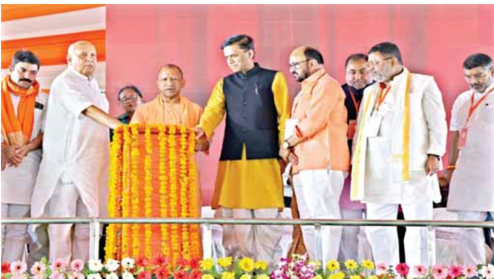
Uttar Pradesh Chief Minister Yogi Adityanath with other leaders during the inauguration and laying of foundation stone of development projects in Deoria district on Tuesday

The then government, he said, was only concerned about the welfare of its own