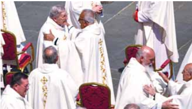
Cardinals hug and shake hands at the end of a mass for mourning late Pope Francis

Perhaps the most dramatic of Francis’ encounters with the Indigenous commu-