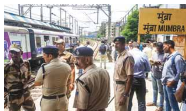
Police at the Mumbra Railway Station after several passengers reportedly Was in four deaths and multiple injuries fell from a moving train, resulting in four deaths and multiple injuries

two local trains were running in opposite directions. Around this, trains are jam-packed during the morning hours when the commuters travel hanging precariously onto the open doors.