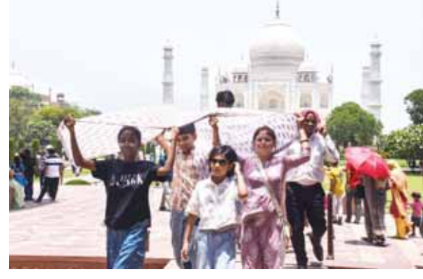
Tourists try to shield theselves from the scorching heat and strong sunlight while visiting the Taj Mahal, in Agra

On Monday alone, maximum temperatures soared above 40 degree Celsius in at least 22 districts across the state. The IMD has forecast