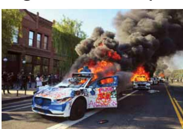
Multiple Waymo taxis burn near the Metropolitan Detention Center of downtown Los Angeles

Several dozen people were arrested throughout the week-