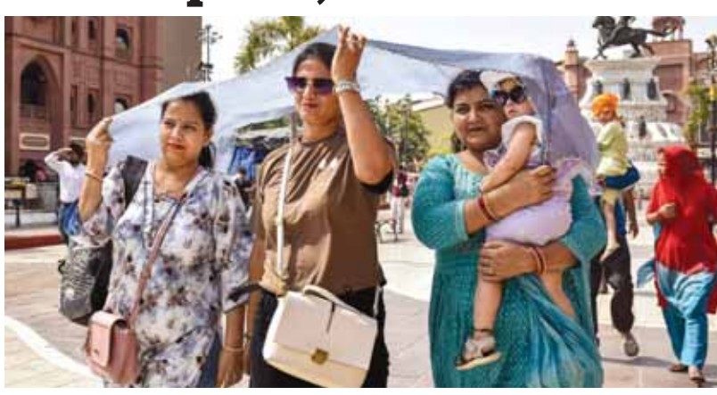
People cover their heads from the scorching heat near the Golden temple in Amritsar on Monday

The IMD said Ayanagar was the hottest region in Delhi which recorded 45.3 degrees Celsius with the nighttime minimum recorded at 28 degrees Celsius, Ridge saw the maximum temperature of 44.9 degrees Celsius with night time minimum recording 25,9 degree Celsius. The maximum temperature ranged between 43.4 degrees Celsius and 45.3 Degrees Celsius — three to four degrees above normal in the national Capital. According to the IMD, very hot