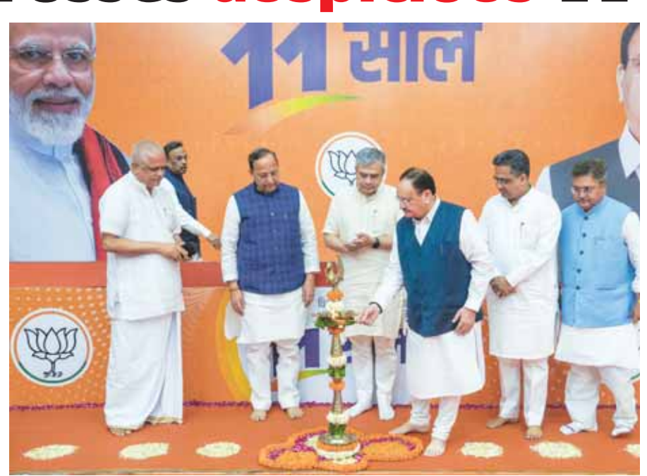
BJP National President JP Nadda with party leaders inaugurating an exhibition marking the completion of 11 years of the NDA government under the leadership of Prime Minister Narendra Modi, at the BJP headquarters

The ministers highlighted the reach and impact of welfare schemes like 'Swachh Bharat Abhiyan' for sanitation, 'Ayushman Bharat' for health insurance, and 'Ujjwala Yojana' for cooking gas, besides measures for housing for the poor,